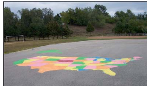
Popular Map of US